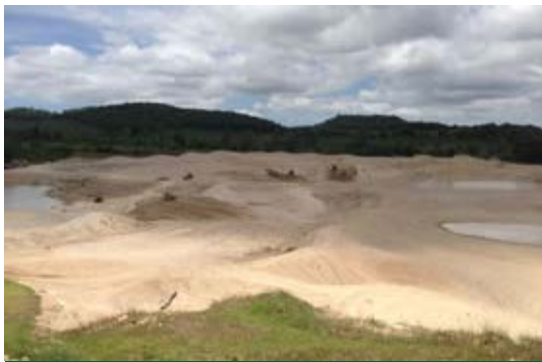
SILKY OAK CC 'B COURSE'