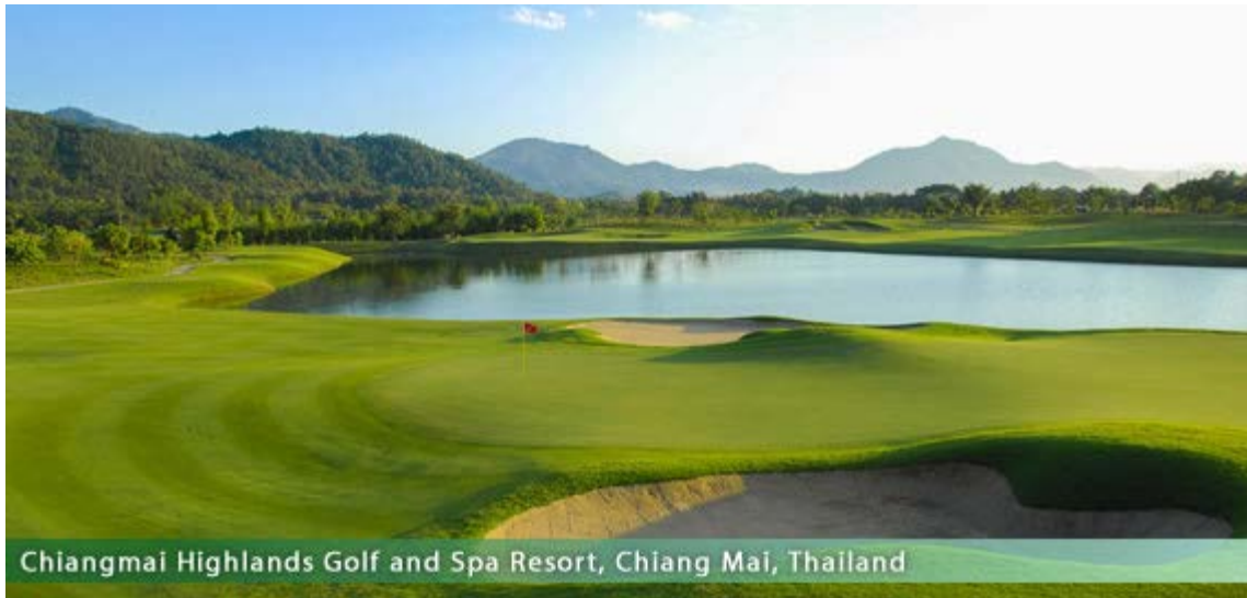
Chiangmai Highlands Golf and Spa Resort, Chiang Mai, Thailand

Chiang Mai, The Rose of the North, continues to grow and attract more tourists, both foreign and domestic. The Night Bazaar and Old City remain the areas most foreign tourists want to be based, while Thais and many young Asians prefer the Nimmanhaemin Road area which has seen significant development in recent years.