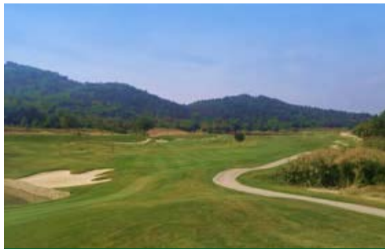
BLACK MOUNTAIN GC NEW 9

Barcelona Valley probably conjures up images of the Spanish Riviera. Of course, this is Asia, so anything goes. From the makers of Khao Yai's Tuscany Valley comes a new concept for Pattaya, and it comes with four 18-hole golf courses to boot. That's right, soon to be Thailand's largest golf complex, Barcelona Valley sits among the existing Green Valley Golf Club, St. Andrews 2000 Golf Club, Silky Oak A Course , and Silky Oak B Course . Silky Oak A Course's 18-holes are operational and condition wise they are the best of the Barcelona Valley Group courses. Silky Oak Course B is well into the construction phase as can be seen in the attached photo. Once finished in 2018, expect a nice addition to the Pattaya golf scene .