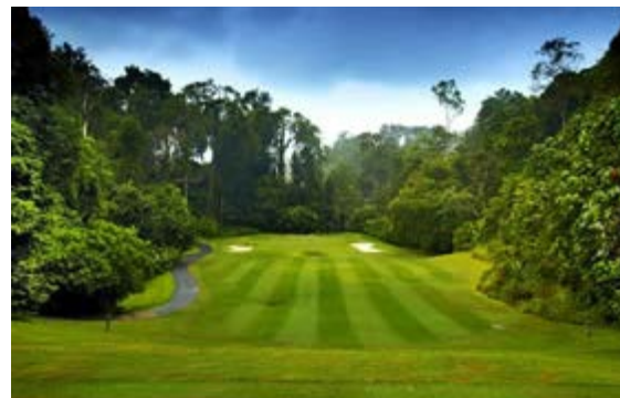
ELS CLUB TELUK DATAI

Just back from the 3rd edition and sold-out Accor Vietnam World Masters I had the opportunity to check-out the progress at some of the areas courses under construction. First up, will be the Nicklaus course at BRG Danang Golf Resort , of which nine holes open for play this November. Then early next year Vinpearl's Hoi An Course will come on stream. As you can see in the photo, I made sure of that