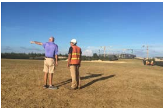
VINPEARL HOI AN