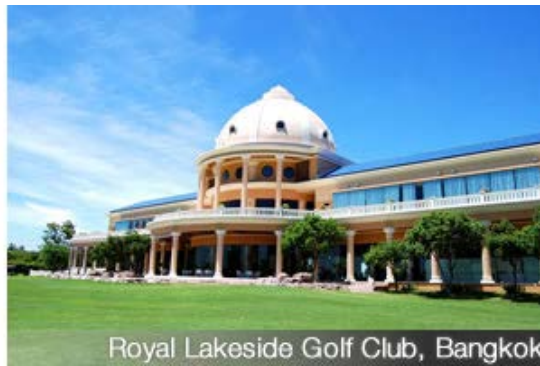
Royal Lakeside Golf Club, Bangkok