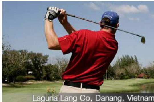
Laguna Lang Co, Danang, Vietnam

Da Nang: Vietnam's central coast has its 3rd golf course. The Laguna Lang Co course between Da Nang and Hue is grassed and ready for play. I was up there 2 weeks ago and the site is really something special. Little earth moving was needed to make the location ready for 18 holes as the course plays naturally through 3 distinct environments: seaside links, low marshlands, and mountain foothills. Soft opening is set for the end of the year, and we are already including Laguna Lang Co in all Da Nang golf tours scheduled for 2013.