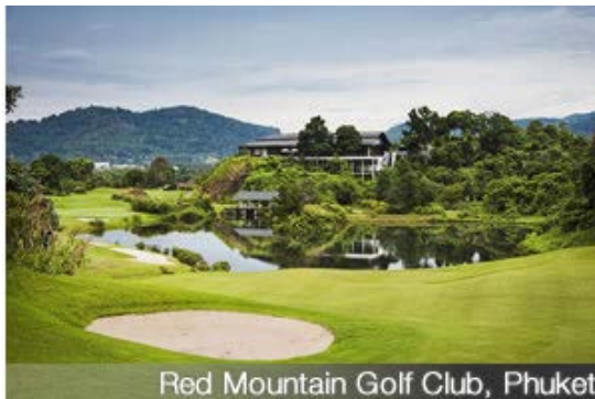
Red Mountain Golf Club, Phuket

Red Mountain Golf Course opened in 2007 and is now considered Phuket's most spectacular golf course. The course was designed to take advantage of a huge variety of landforms and dramatic elevation changes, making it Phuket's hilliest course.