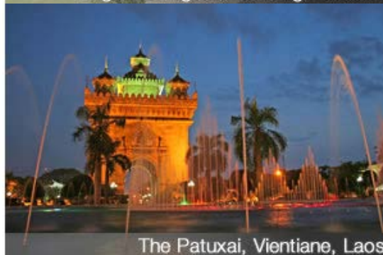
The Patuxai, Vientiane, Laos

Vientiane: I have long been hearing rumors about the owners of Long Thanh in Saigon building a sister course in Laos and now I can confirm this is true. Long Vieng Golf Club outside Vientiane starts with a grand entrance that leads down a lane about 1 kilometer long to the course. It appears they have a very large parcel of land suitable for residential real estate development with the golf course being the central attraction. The clubhouse being built is huge and might just be a replica of the one at Long Thanh. Earthworks has created mounding and waterways that frame the holes on the relatively otherwise featureless land. Play is open although further turf grow-in is needed to mature the course.