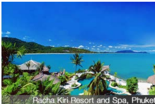
Racha Kiri Resort and Spa, Phuket

This Southern Thailand golf holiday combines the most relaxing golf spa resorts with excellent golf courses in Southern Thailand. The golf trip is well suited for those wanting to be at the best golf courses each morning and sipping cocktails on the beach or having a spa treatment by the evening. This two centre option combines luxury in Phuket with the peaceful contrast of Racha Kiri where you can explore this unspoilt getaway.