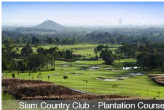
Siam Country Club - Plantation Course

Pattaya Amateur Golf Week - March 2013 Date: March 10 - 16, 2013 | Location: Pattaya, Thailand [Find out more]