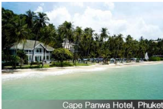
Cape Panwa Hotel, Phuket

Cape Panwa Beach is perfect for year round swimming. Phuket's south western winds blow from May until October making the seas on the west coast quite rough. However, the seas on the east coast, especially at Cape Panwa, are sheltered and calm.