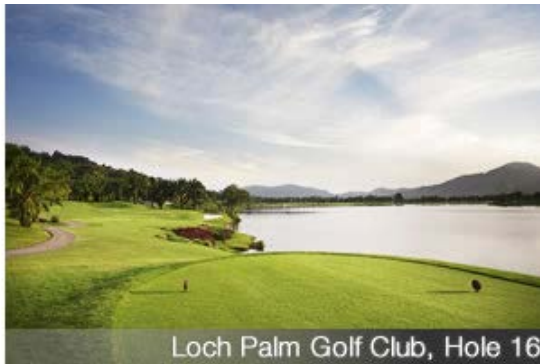
Loch Palm Golf Club, Hole 16

There are 8 golf courses in Phuket including two nine hole options, the best being Red Mountain and the Blue Canyon championship course. There are other options if you don't want your holiday golf too tough with popular courses such as Loch Palm, Laguna, Blue Canyon Lakes and oldest course on the island, Phuket Country Club. If you want spectacular views then Missions Hills is must visit with the course in good condition and the views over Phang Nga are not to be missed.