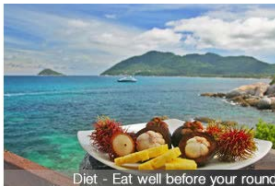
Diet - Eat well before your round

So don't over eat before the game, have light easy to digest food avoiding fatty foods. During your round eat plenty of fruit, they are a good energy source especially bananas and make use of the many drinks stops taking in as much water as possible.