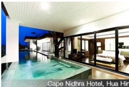
Cape Nidhra Hotel, Hua Hin

service and an enviable location within walking distance to Hua Hin town center. Hua Hin golfers who stay at Cape Nidhra Hotel are assured of a unique, enjoyable and service-oriented golf holiday experience. All rooms are beautifully finished with the finest local materials, richly polished hardwood and luxury amenities. Part of the prestigious Cape Hotel Collection, Cape Nidhra Hotel is an impressive property that will exceed all the expectations of golfers visiting Hua Hin.