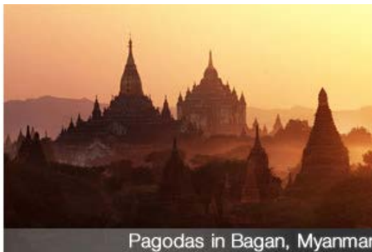
Pagodas in Bagan, Myanmar

This 14 days Myanmar Golf & Culture Holiday Package is an excellent opportunity to combine a cultural visit to magical Burma and combine it with the best golf courses that Myanmar has to offer. You will stay in the very best hotels in each destination and be taken to the must see sightseeing attractions within each destinations. This fully guided and customizable Myanmar Golf Holiday is a truly unique way to experience this mystical country.