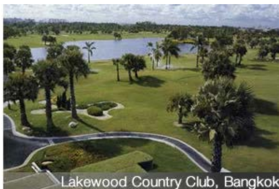
Lakewood Country Club, Bangkok

end. Once completed Lakewood will boast 54 holes making it the largest of any Bangkok golf club. Stay tuned for more details in coming months. I expect the new course to be very good!