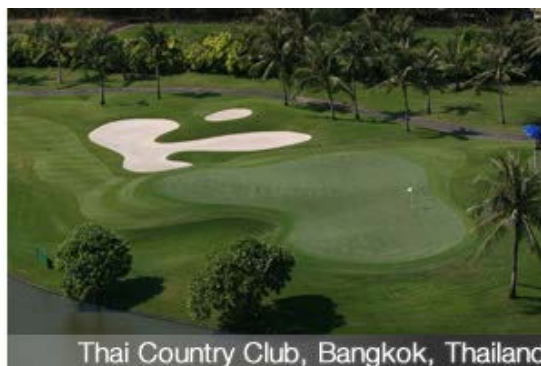
Thai Country Club, Bangkok, Thailand

Thailand (7): There is good golf cross the country with most of best courses in Thailand in and around Bangkok, Pattaya, and Hua Hin. Thai Country Club has hosted more professional golf events than any other Thai golf course. Black Mountain Golf Club is the only golf course in Thailand to be rated in the top 100 courses outside the USA by Golf Digest .