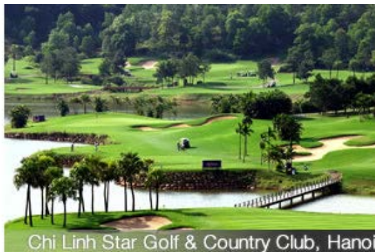
Chi Linh Star Golf & Country Club, Hanoi

Hanoi: Good and bad golf news from the Vietnam capital city. The military related Long Bien Golf Club is getting excellent reviews, not only because it is the most conveniently located and lowest priced course Hanoi golf course, but also because of the excellent playing conditions and interesting layout. That's the good news. The bad news is that the course has such a high demand from local golfers, it is closing to visitors, at least for a while. On the other hand, better visitor accessibility to other Hanoi golf courses as well as new construction coming on line will make up for, at least in part, for this new development. In any case, I don't expect this to last long and I will keep you posted as the situation changes.