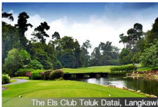
The Els Club Teluk Datai, Langkawi

Kuala Lumpur: The Malaysia government continues to invest heavily in promoting golf tourism and rightly so. The generally off-the-beaten track for golf tourism nation faces an uphill battle to compete, especially in terms of world-class service, with its neighbors in Thailand and Bali. However, with opening of courses like the Els Club Teluk Datai and improving visitor accessibility to PGA venues like Kuala Lumpur Golf & Country Club , the standard of golf in Malaysia is definitely something all golfers should take notice of. Moreover, it is hard to find any other country with such a diverse range of golf environments. From big cities, to tropical islands, to virgin rain forests, golf in Malaysia is available in practically every setting imaginable.