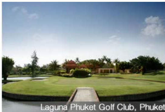
Laguna Phuket Golf Club, Phuket