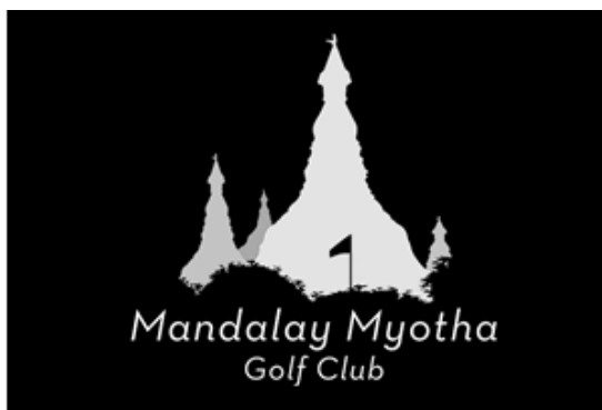
Mandalay Myotha Golf Club