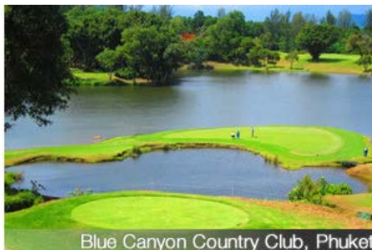
Blue Canyon Country Club, Phuket

Until the next newsletter, happy golfing and I hope to see YOU in the area very soon!