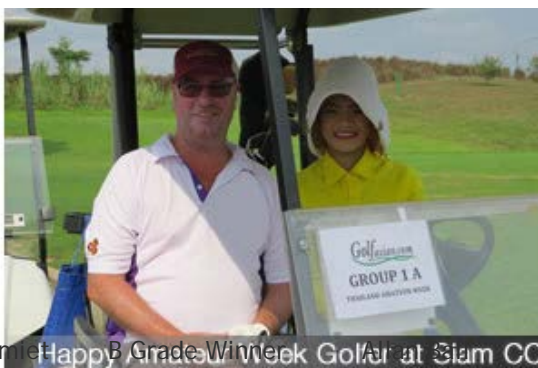
Happy Amateur Week Golf at Siam CC