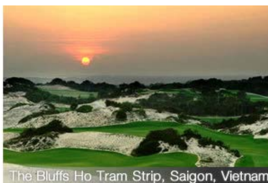
The Bluffs Ho Tram Strip, Saigon, Vietnam