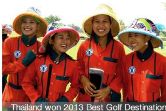
Thailand won 2013 Best Golf Destination

Why golf in Thailand? Thailand is probably the most spectacular golfing destination in the world, the beauty of her golf courses expresses it all. We have lush greenery year round with palm trees and every other type of tropical flora and flowers creating a feast for the eyes. Beautiful lakes and waterways, birds you've never seen before become a breathtaking walk in the park. Churchill was so wrong when he said "golf is a good walk spoiled" - he never played in Thailand!