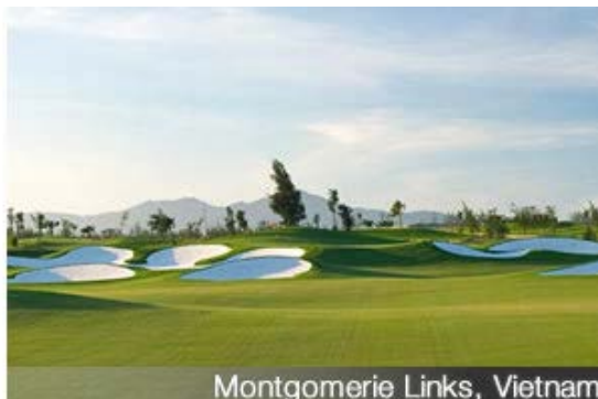
Montgomerie Links, Vietnam