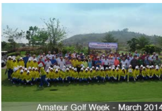
Amateur Golf Week - March 2014