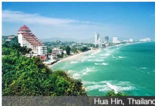
Hua Hin, Thailand

Pinehurst in South Carolina, a genuine golfing mecca.