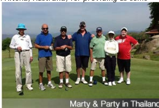
Marty & Party in Thailand