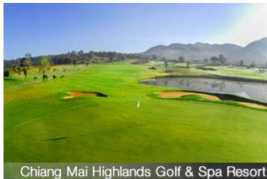
Chiang Mai Highlands Golf & Spa Resort

Chiang Mai: The new Schmidt-Curley designed 9 holes at Chiangmai Highlands are taking shape. Major earthworks are progressing and could be completed by the end of July. The plan is to have all 27-holes open for play by the end of the year. There is not a lot of water, but there are some interesting holes. Both par 3s are excellent, playing downhill with significant elevation change using natural topography. Also, starting and finishing with par 5s insures the challenge of the new nine will rival the existing 18. There is one long walk between holes, though otherwise the course is "walking friendly".