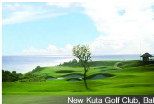
New Kuta Golf Club, Bali

The island's first course, Nirwana Golf Club , designed by Greg Norman, opened in 1994 and has been one of Asia's favourite and most highly regarded layouts ever