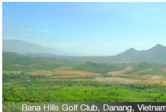
Bana Hills Golf Club, Danang, Vietnam

Danang: In a bid to make Vietnam's best golf destination even better, construction at Bana Hills Golf Club is once again underway. Several holes of the world's first Luke Donald course are already shaped, drainage is being added, and a grass sod farm is being maintained. Plans are for all 18 holes to be completed within 1 year and the course to open in 2016. Here is a panoramic shot of the entire site you can see the work going on. Once operational, Bana Hills will be the 4th course to be part of the Golf Coast Vietnam . I can't wait!