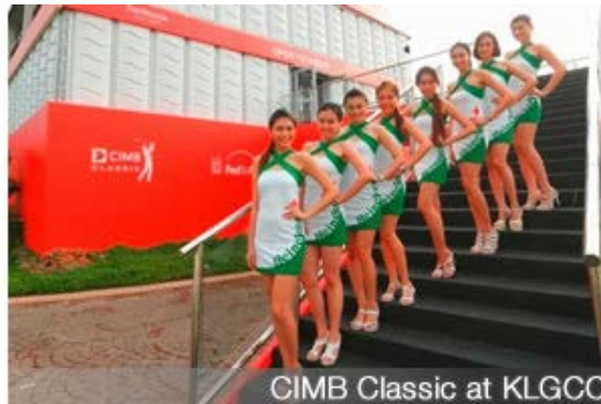
CIMB Classic at KLGCC

Kuala Lumpur: October will see both the US PGA and US LPGA once again make their way to Malaysia's capital and preeminent golf club, Kuala Lumpur Golf & Country Club . October 9-12 is set for the ladies Sime Darby and while the men get underway on October 30 at the CIMB Classic. This year's purses are US$2M and US$7M, respectively. Why not plan a Kuala Lumpur golf tour to coincide with either of the events and let us create a stay-play-watch package for you? Tip: Travel on one of the practice days before an event starts and you can get inside-the-ropes and see all of the PGA and LPGA stars.