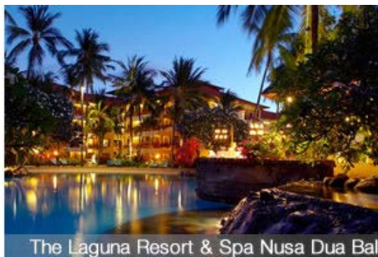
The Laguna Resort & Spa Nusa Dua Bali

The Laguna Resort & Spa Nusa Dua Bali is a luxurious 5-star hotel centrally located in Nusa Dua and only ten minutes from Bali Golf & Country Club. This luxurious hotel provides Balinese hospitality and local design with 24 hour butler service and free of charge Wi-Fi internet access. This hotel is perfect in terms of value for those wanting to mix-in a little bit of sightseeing, golf and beach relaxation while visiting the island.