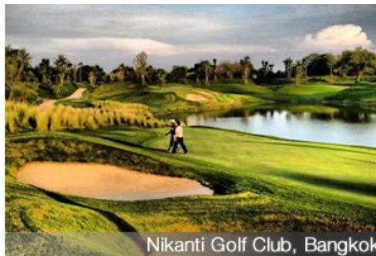
Nikanti Golf Club, Bangkok

Kingdom's best. Located an hour's drive west of Bangkok and designed by Golf East ( Banyan Golf Club ), Nikanti has a unique 6/6/6 formula - with two par 3s, two par 4s and two par 5s in three six-hole loops. Nikanti will be a pay-for-play course and costs will be all-inclusive (green fee, golf cart, caddie fee and tip, two meals, and non-alcoholic drinks). Nikanti will open in late 2014 and is bound to attract considerable attention from Thai golf visitors. Watch for more details in coming months.