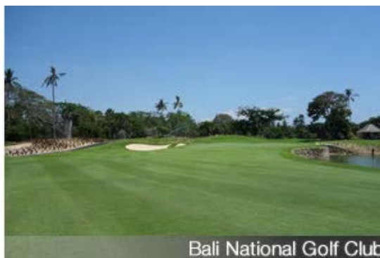
Bali National Golf Club

The Bali golf course now features new Paspalum turf, with scalloped bunkering lining most fairways and elevated greens. Many of the newly routed holes have lengthened to championship distances as the course now plays to over 7100 yards from the tips.