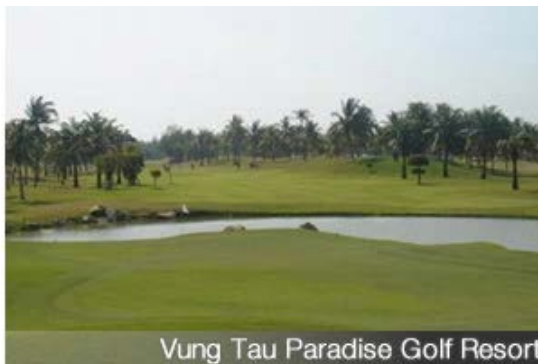
Vung Tau Paradise Golf Resort

Vung Tau on a great site with an extravagant casino and hotel attached. Vietnam Casino City Golf Club is a Norman design, with IMG doing the construction and pre-opening management. I wish they could think of a more unique name, but anyway the intention is to have it open within a year. However, I think this is highly optimistic, especially given the location.