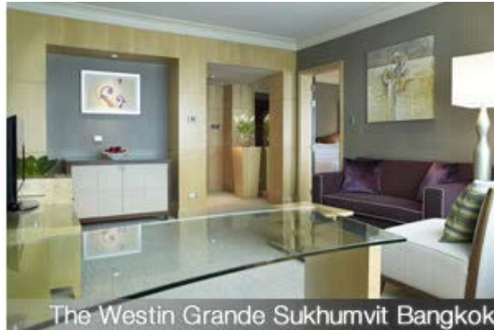
The Westin Grande Sukhumvit Bangkok

Renew and recharge at Bangkok's best five-star address for golf, business or pleasure, The Westin Grande Sukhumvit, Bangkok. Situated in the heart of Bangkok's prime shopping, restaurant, and entertainment area, and with the added convenience of the sky train and the subway mere steps away, you will be instantly transported to all that Bangkok has to offer.