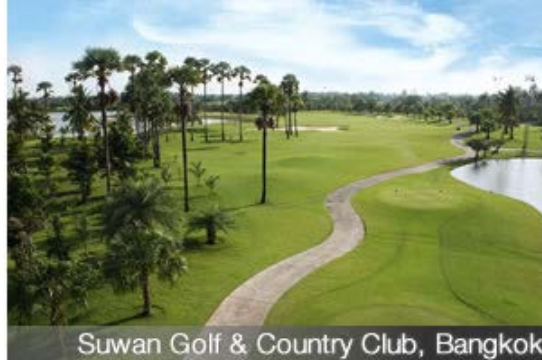
Suwan Golf & Country Club, Bangkok

Suwan Golf & Country Club is in the countryside west of Bangkok. The drive from Bangkok goes through several rural villages that add to the course's uniqueness. Surrounding fruit orchards, rice fields, palm trees, and lotus ponds make Suwan Golf have a tropical-Thai character which is most appreciated by both golf professionals and golf holidaymakers alike.