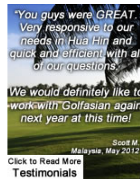
Click to Read More Testimonials

Another good reason to be registered on the Golfasian mailing list!