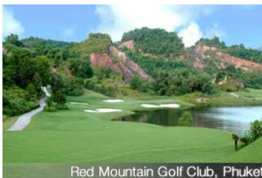
Red Mountain Golf Club, Phuket

Date: March 10 - 16, 2013 | Location: Pattaya, Thailand