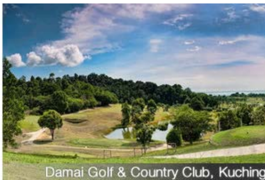
Damai Golf & Country Club, Kuching

Kuching: Damai Golf and Country Club has completed their long overdue greens renovation project. Using the latest ultra-dwarf Bermuda grass with improved sub-surface drainage this firm up the greens and improve playing conditions at Damai, especially after heavy rains. Being a fan of Arnold Palmer designs, Damai has been my longtime Kuching golf favorite and I look forward to playing there again soon.